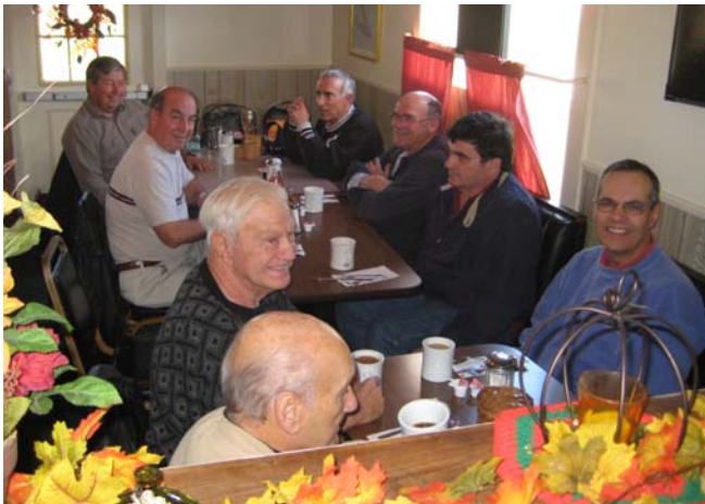
Here's the gang waiting for their food to arrive at Campy's Country Kettle.