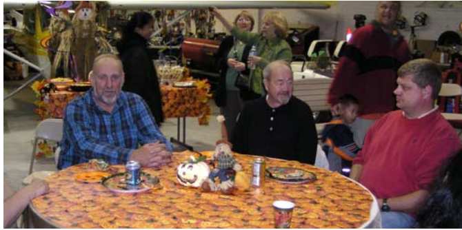
Just Two of the tables