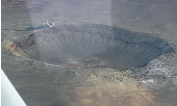
Meteor crater from 55F pix/ RWolff

Thought I would send a picture or two of our flight to Reno. The longest leg was 5hr 50 min from Albuquerque to Reno non-stop. On that leg, we flew over of Las Vegas. We were up to 14,000 ft and had a tail wind most of the way. We also flew over Meteor Crater on the way.