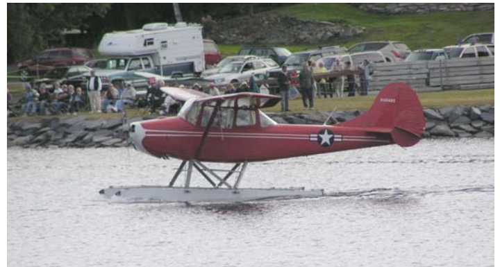
This Bird Dog just loves the water