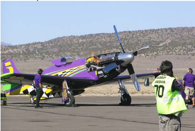
2008 unlimited winner

The trip between Vegas and Reno was very remote and went right by the infamous Area 51. I was told "you will be met by the air force if you get too close". The decent from 12,000 to 6,700 ft at Reno required a tight circling maneuver between the tower and a nearby mountain. The race was worth the trip.