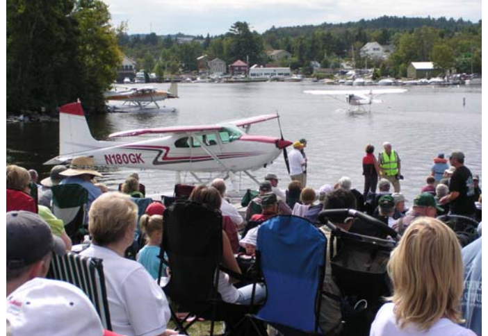
A perfect day with light winds for the bulk of the events on Saturday