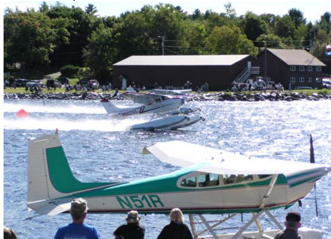
These are two float planes competing in the shortest take off event.