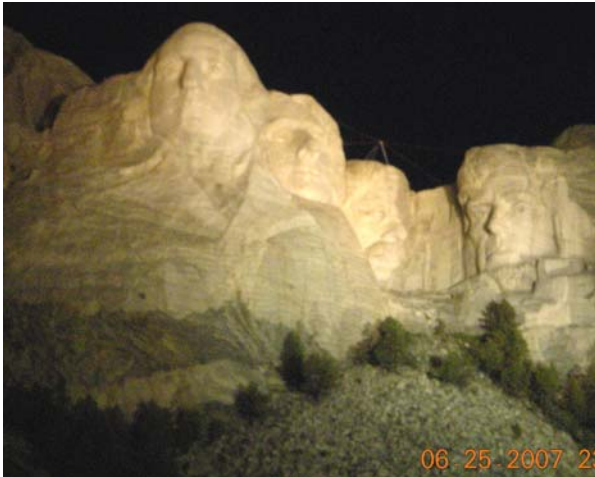
Just one of the sites