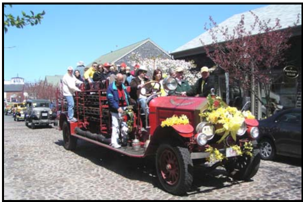
Decorated fire truck in the Daffodil Parade