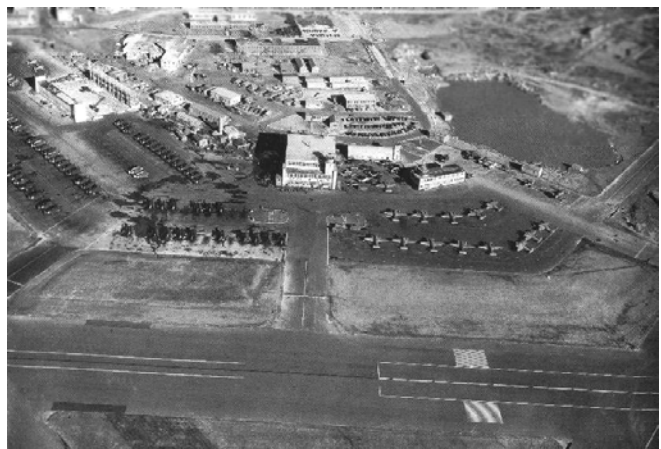
Charlestown Airport WWII