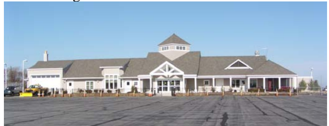
The New Terminal at Block Island

The SFZ "Fly to Lunch Bunch" decided to check out the new airport terminal on Block Island this month. On Sunday, February 1 st even though winds were reported at 200 degrees, 21 knots gusting to 28 at BID, a few of us still ventured out there. The weather was sunny with unlimited visibility, but rather bumpy. We ended up with five airplanes from SFZ with a total of 11 people meeting for lunch. I had a real nice picture of the gang at the new Bethany's Restaurant, but it was accidentally deleted. "I hate when that happens". So I guess we'll just have to do it again. The new Bethany's is very nice and bit larger than before. They still have a counter to eat at with additional seating at tables. I hope they will add some outside tables in the summer with a view of the runway. Like before, that always added entertainment while eating.